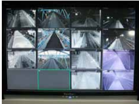
The footage and thermal data from the seven FLIR A310 thermal imaging cameras is sent to the PLC and to the control room.

coal is transported to the boilers at a speed of four meters per second several additional FLIR A310 thermal imaging cameras check the temperature along the way. If at any point the temperature of the coal rises above a previously determined parameter an alarm goes off.