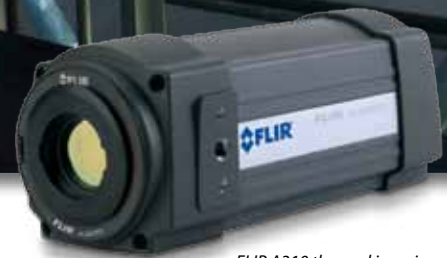
FLIR A310 thermal imaging cameras are mounted in protective housings above the coal transport belts.

To avoid the risk of spontaneous combustion in the coal conveyor system at the Dangjin Coal Fired Power Complex (DCFPC) in South Korea the owner of the plant, the Korea East-West Power Company (EWP), has installed a fire warning system based on thermal imaging cameras. By detecting a rise in temperature long before it rises to the point where the coal reaches combustion the thermal imaging cameras help ensure the plant safety and continuity of power production.