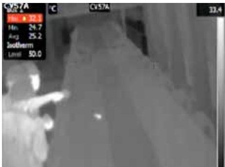
Tests by EWP employees have clearly shown that the thermal imaging early fire warning system is very effective in preventing coal fires.