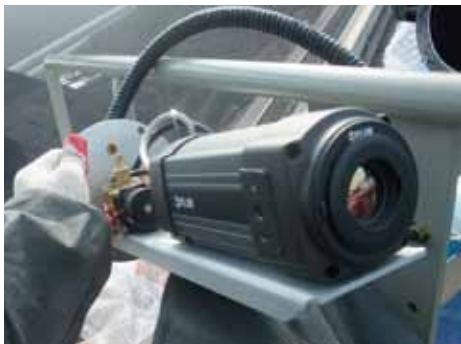
The FLIR A310 thermal imaging cameras are mounted over the conveyor belt in waterproof protective housings.

One FLIR A310 thermal imaging camera is installed at the storage end, checking the coal as it enters the conveyor system. As the