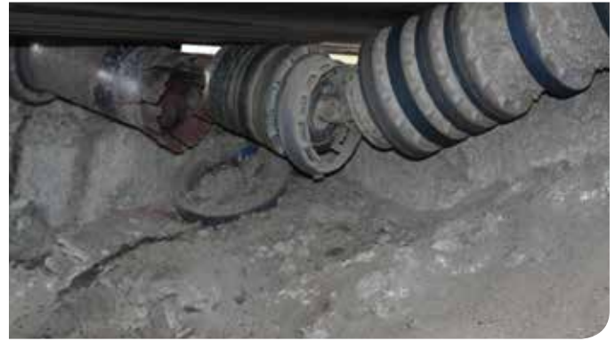
Defective lower support roller of a belt conveyor

permanently installed thermal imaging camera from the FLIR A series. The FLIR A310 was mounted on the bed of an SUV and pointed in about a 45-degree angle to the direction of travel. Among other things, a special housing unit was required to securely mount the FLIR A310. The thermographic camera system can operate without any cable connection, because it includes a battery power supply and a wireless communication unit.