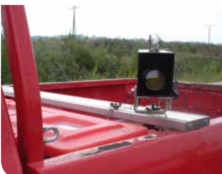
The FLIR A310 was mounted on the pick-up in a special protective housing

Due to the success of the test, the mobile thermographic monitoring solution will be implemented as the new standard at MIBRAG in the areas of mining and strip mining in Profen and Vereinigtes Schleenhain starting in December 2015. But Klaus Flocke from Inau still has some work to do: "Due to the fact that the test was so successful, we are already preparing a test run in the power stations and the dust factory." Klaus Flocke and MIBRAG thus continue their commitment to security - and at FLIR, we are also proud to be able to contribute to this endeavour.