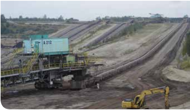
Belt conveyors at the mine in Profen