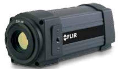
The FLIR A310 thermal imaging camera