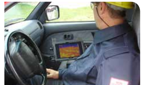
Monitoring with the tablet PC