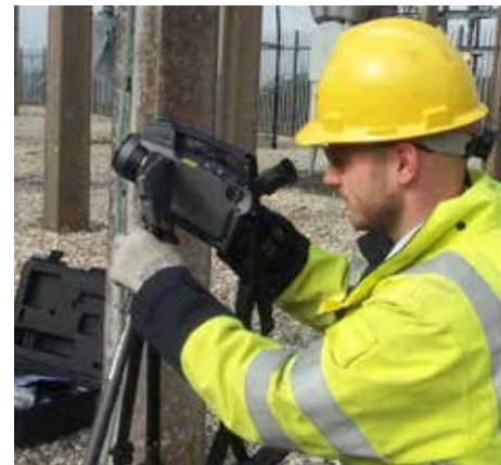
With the GF306, you can look at the switch gear equipment from a safe distance.

Users of the GF306 at SSEPD especially value the High Sensitivity Mode (HSM),