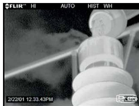
During their first FLIR training course, SSEPD identified a leak on a recently installed high-voltage circuit breaker.

For more information about thermal imaging cameras or about this application, please contact: