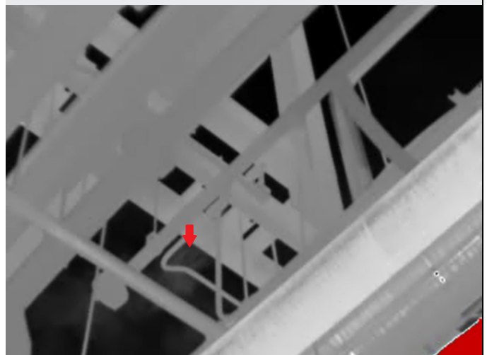
Figure 3: Overhead leak found on a pipe bridge with a FLIR GF304 OGI camera. This leak would not have been identified using traditional leak detection technologies.