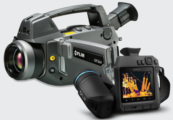
Figure 2: The FLIR GF304 cooled OGI camera (L) and the GF77 uncooled OGI camera (R) used to identify HFC-leaking components.

Several types of leaks were among the training examples used to introduce OGI to his Chemours colleagues: